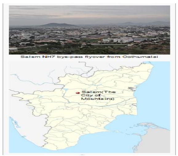
Figure 5.3 Study area

Salem is located at 11.669437°N 78.140865°E. The average elevation is 278 m (912 ft). (Figure5.3) The city of Salem is surrounded by hills on all sides viz. Nagaramalai to the north, Jarugumalai to the south, Kanjamalai to the west, Godumalai to the east and the Shivery Hills to the north east. The Kariyaperumal Hill is situated within the city to the southwest. Salem city has 4 constituencies viz. Salem North, Salem South, Salem West and Veerapandi.[7] An MP constituency also had been created in the name of Salem containing Salem city, Omalur, Edappadi taluks of Salem district. Salem city is administrated by Salem City Municipal Corporation, which consists of 60 Wards. It also serves as the headquarters of the district with the same name (Salem District).