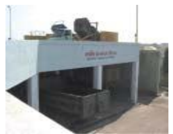
Figure 5.2 Implementation through Private Participation

(a) a government body/utility that may be specifically incorporated for implementing such regional projects in the state (which mav thereafter implement through its own staff, or contract out activities): or (b) through a Public Private Partnership (PPP) structure, wherein a concession is granted by the land-owning entity (state or lead ULB). A robust PPP framework will be based on the following principles: Provide for a framework that permits private investment and debt financing of Regional MSW Projects; Provide a legal framework for the enforcement of contractual obligations between municipalities, on the one hand, and municipalities and private entities, on the other; Provide a framework for grant of contracts that is clear, transparent and stable to encourage Transfer station, Rajkot city, Gujarat, India. Small vehicles climb a ramp to empty waste into larger vehicles stationed at a lower level. Transfer stations enable costs of transportation over longer distances to be optimized. Greater private participation and fair sharing of risks between private participants and municipalities: and Permit creation of special funds/escrow accounts to enable securing of payment obligations of municipalities to the private developers. Furthermore, it is proposed to harmonies the existing institutional structures and evolving legislations to create a robust and transparent framework for the implementation of Regional MSW Projects in the country.(Figure 5.2)