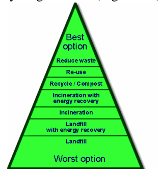
Figure 2.1 Solid waste management hierarchies

Waste treatment techniques seek to transform the waste into a form that is more manageable, reduce the volume or reduce the toxicity of the waste thus making the waste easier to dispose of. Treatment methods are selected based on the composition, quantity, and form of the waste material. Some waste treatment methods being used today include subjecting the waste to extremely high temperatures, dumping on land or land filling and use of biological processes to treat the waste. It should be noted that treatment and disposal options are chosen as a last resort to the previously mentioned management strategies reducing, reusing and recycling of waste (Figure 2.1).